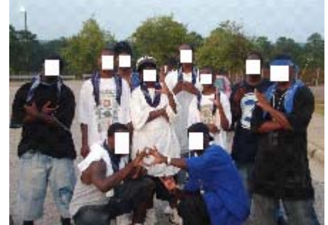
(U) Figure 5: MCAS Beaufort Marines flashing Crip signs as posted on My Space.com.

members stationed at Fort Bliss, for instance, have joined forces to commit assaults on civilian gang members.