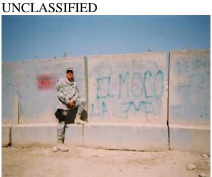
( U ) Figure 2: Mexican Mafia graffiti in Iraq.

• (U) According to open-source reporting, in 2004 a soldier and suspected gang member stationed in