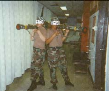
(U) Figure 4: Female soldiers flashing gang signs and brandishing weapons.