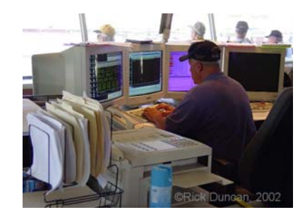
Figure 5 Sorting Hump