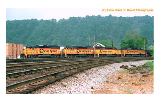
Figure 4 Rail Yard Sites Near Hills

Trains are put together in the classification yard, which is comprised of multiple parallel tracks branching out from a central track and connected by switches. Each of the parallel tracks is designated to receive cars with particular destinations along the route. A special locomotive, or switch engine, transports each car or group of cars to its assigned track. Depending on the sensitivity of the shipment and the type of classification yard, cars may be either "shoved to rest" or "humped." If shoved to rest, the car remains attached to the engine until it couples with the adjacent car. If humped, the car is uncoupled at the top of a very gentle incline and allowed to travel freely downhill.