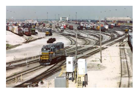
Figure 3 Rail Yard Illumination by Day