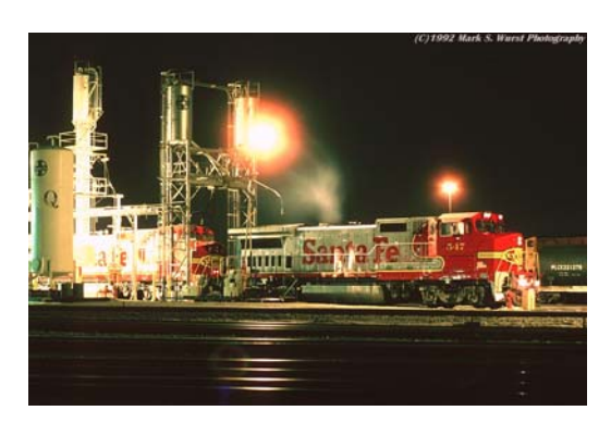
Figure 2 Rail Yard Illumination by Night

Passive security in modern rail yards generally consists of high illumination by day and night, which enables good control of access to the property and minimizes the incidence of trespassing (Figures 2 and 3). Active security is accomplished by armed patrols and strategically placed video cameras. Perhaps counter-intuitively, it is likely that remote locations offer better potential security from human incursion because low surrounding population densities render the presence of unidentified persons or groups in the yard or its immediate vicinity more suspect.