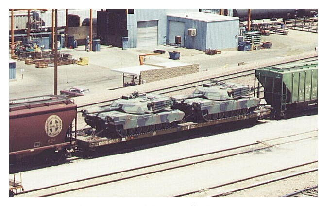
Figure 8 Military Shipment

Current yard surveillance systems are intended to prevent vandalism and theft of goods from rail cars during layovers, which can last 24 hours or more. Access to yards by authorized personnel or individuals who may accompany them or be admitted by their permission is not monitored at all times in all yards.<sup>1</sup>